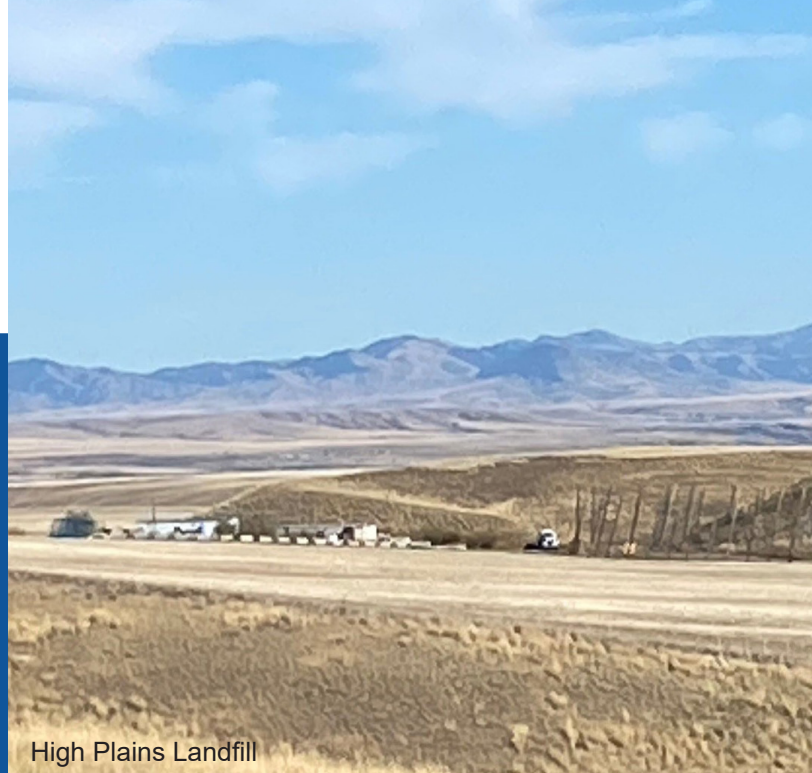
High Plains Landfill