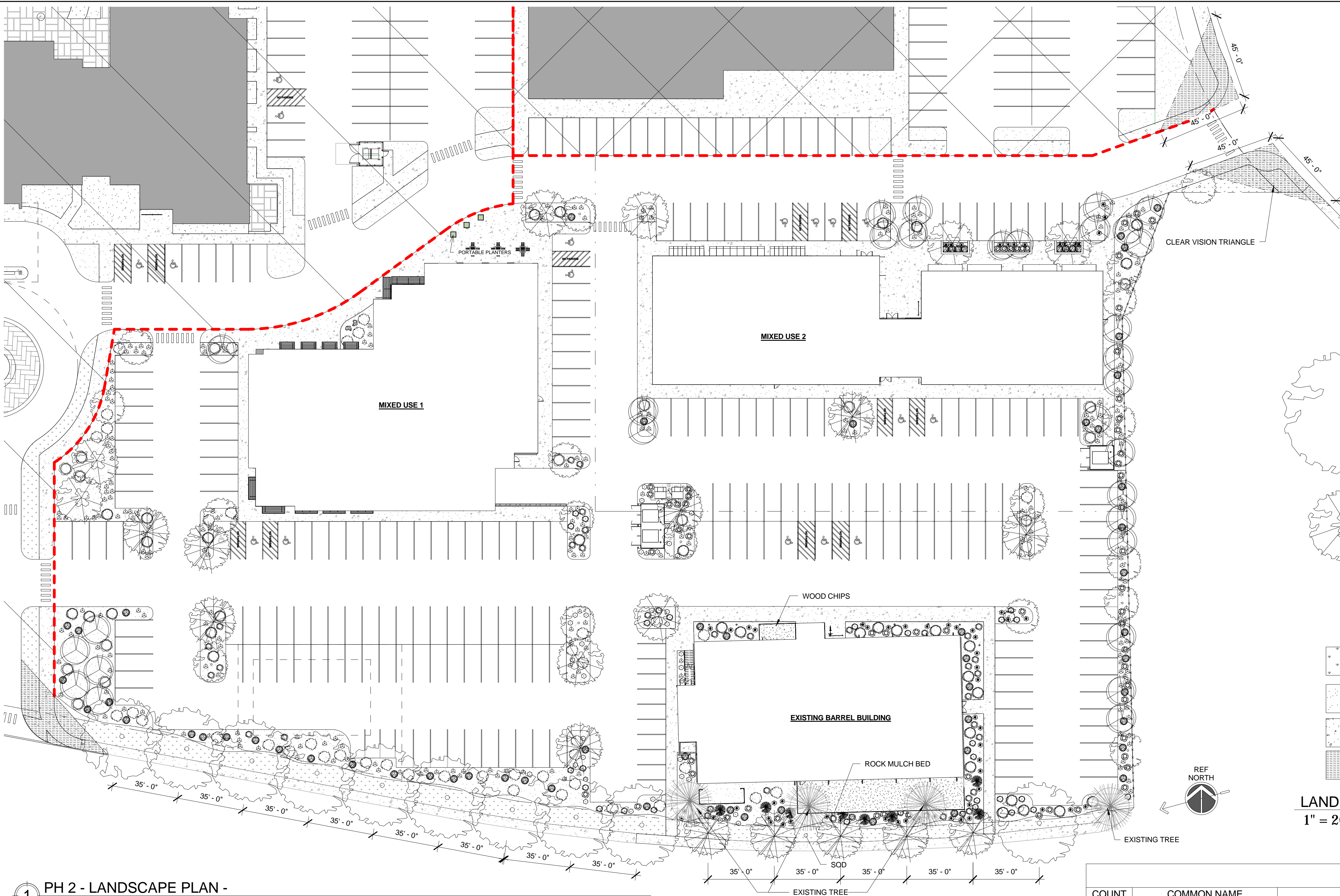
PH 2 - LANDSCAPE PLAN - 1" = 30'-0"

CHANGES TO PLANT SPECIES WILL BE APPROVED BY PLANNING AND COMMUNITY DEVELOPMENT DEPARTMENT. FINAL PLANTING LAYOUTS AND ARRANGEMENTS WILL BE DESIGNED BY LANDSCAPE ARTIST MIKE HOLLERN WITH TOTAL PLANT COUNT WILL BE MET.