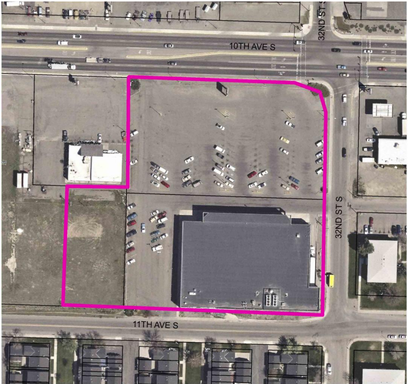
EXHIBIT C - AERIAL MAP (GIS)