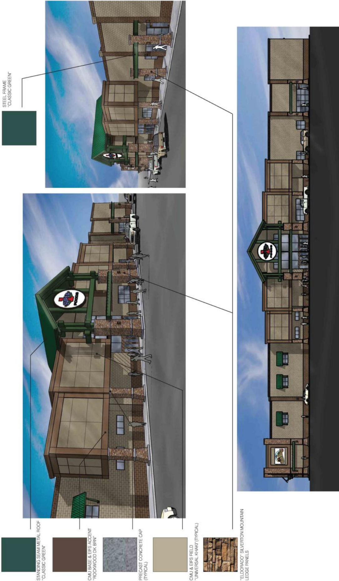
EXHIBIT I - ELEVATION RENDERINGS