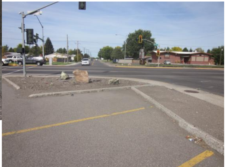
NORTH VIEW OF INTERSECTION OF 10TH AVENUE SOUTH, 32ND STREET