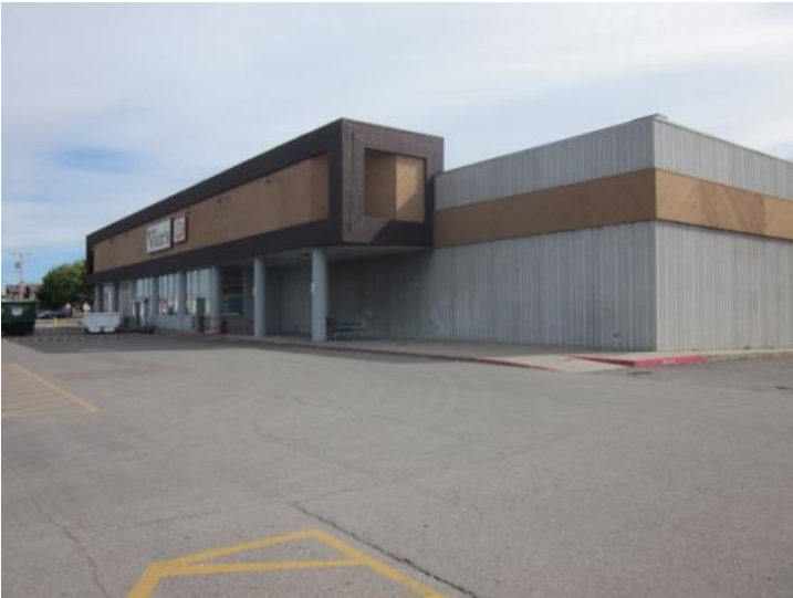
LOOKING SOUTHEAST TOWARDS CURRENT BUILDING AND FASCADA