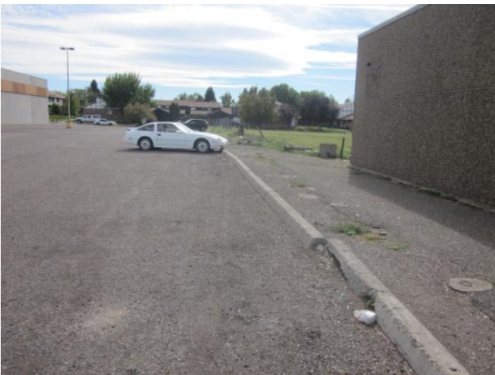
SIDE VIEW ALONG WESTERN PROPERTY LINE, ADJACENT TO FLAMINGO BAR BUILDING AND LOT