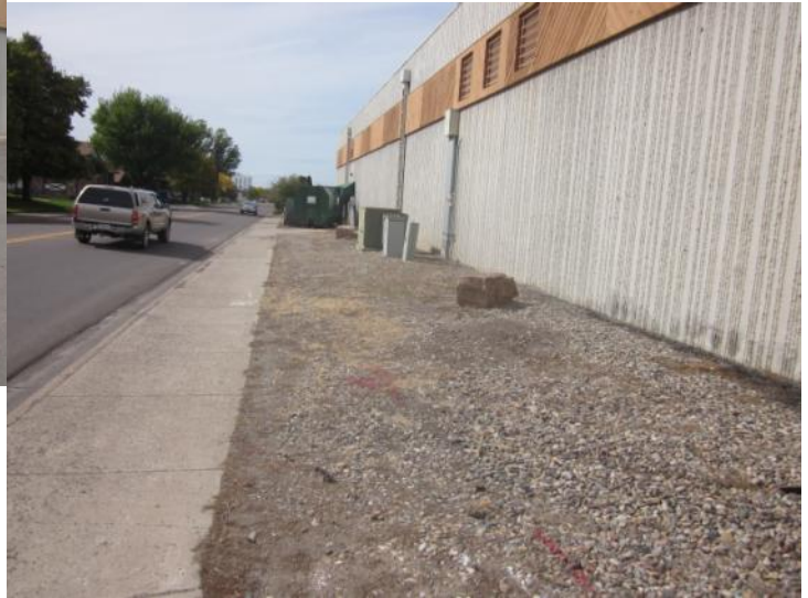
REAR VIEW OF SITE FOLLOWING 11TH AVENUE SOUTH