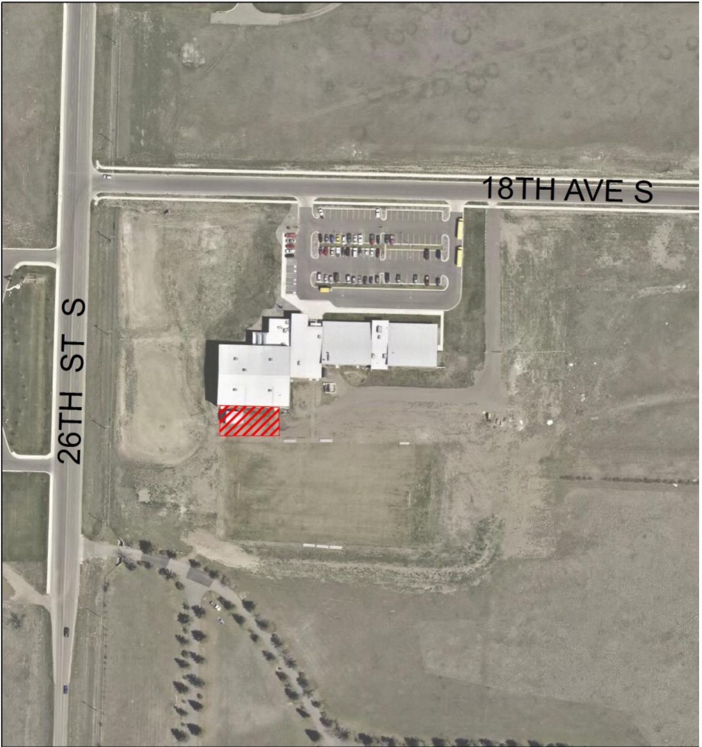
EXHIBIT B - AERIAL MAP