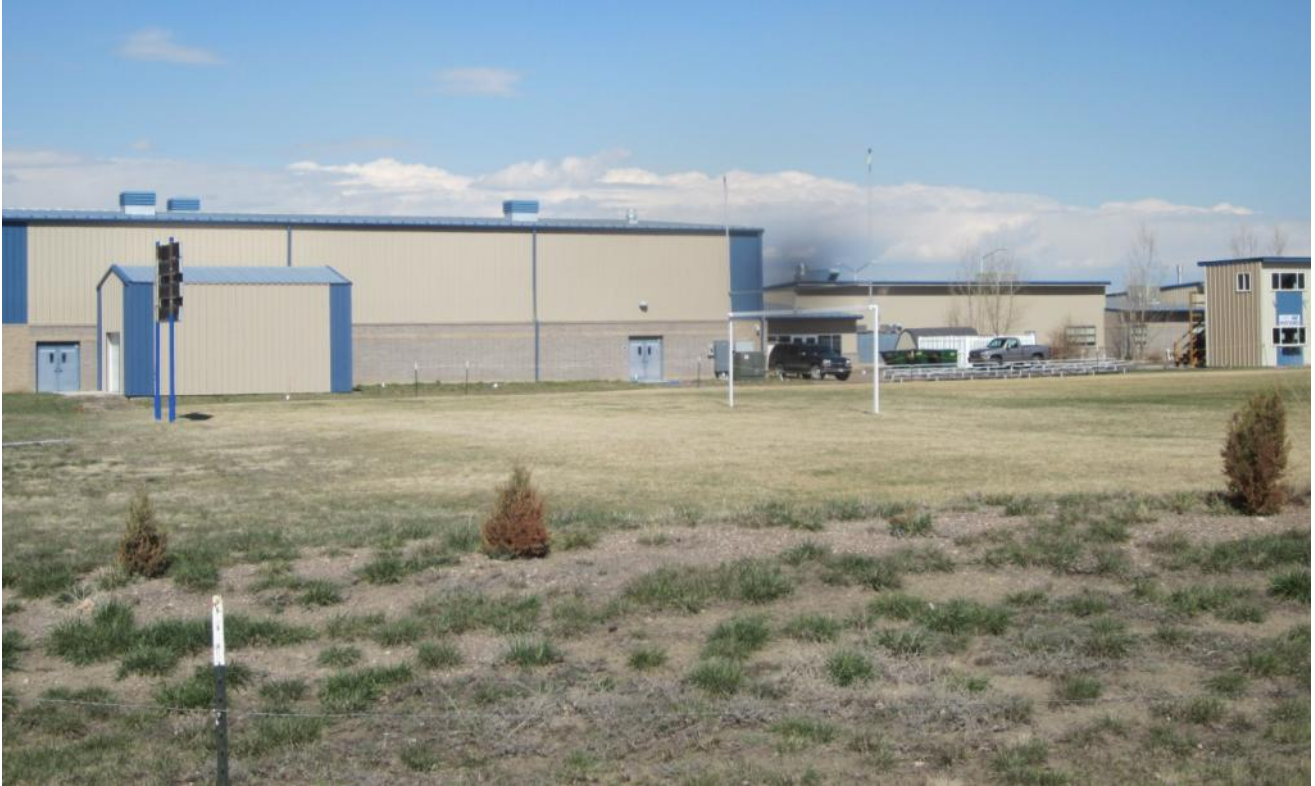
View north from the south.