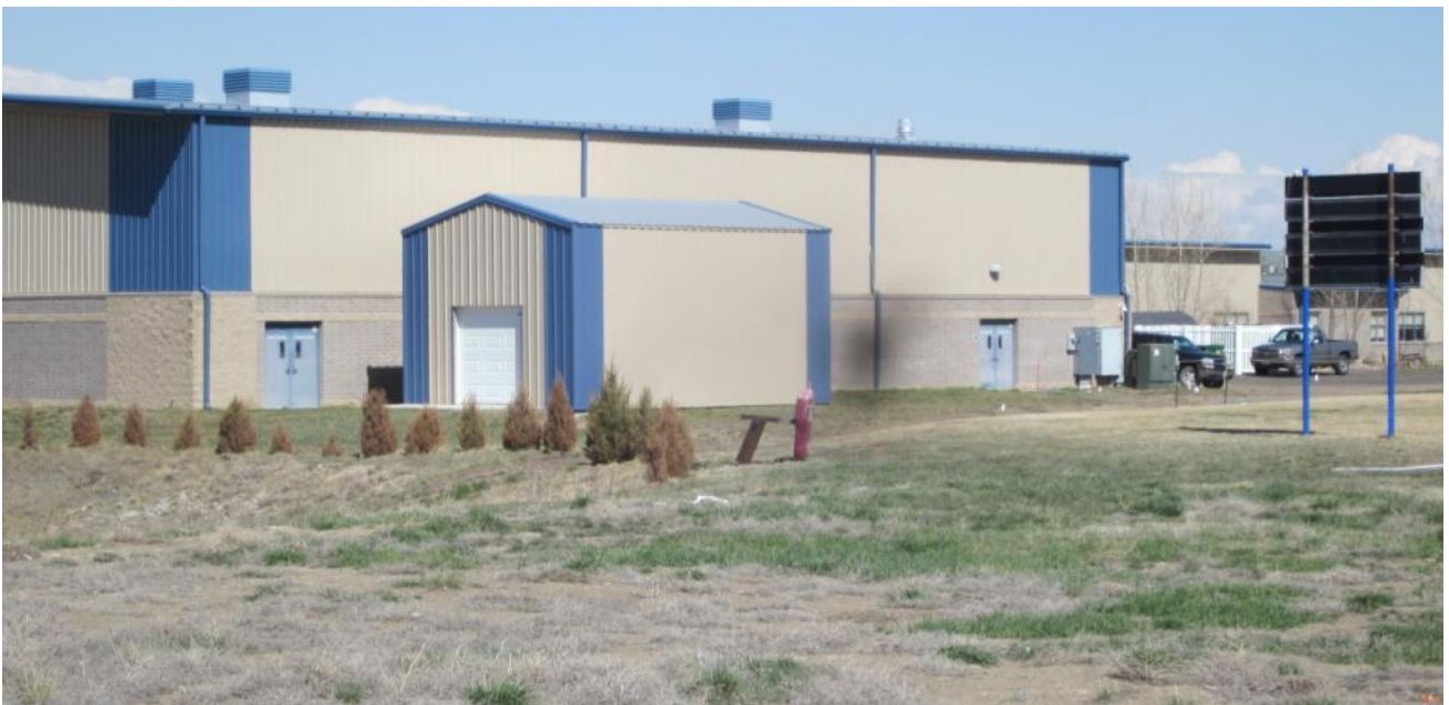
View northeast from 26th Street South.