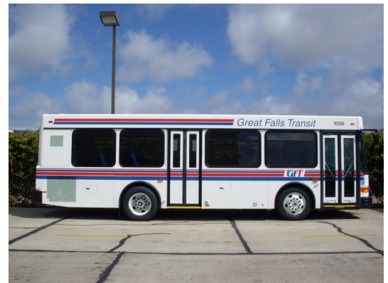
Great Falls Transit District bus to be purchased in part with a Federal Transit District Section 5309 Grant

Because the Planning Board (as the Great Falls Metropolitan Planning Organization) is one of the approval agencies for TIP, the Board is being asked to consider a number of amendments shown on the tables headed “Table 4” and summarized on pages 2 and 3 of this report.