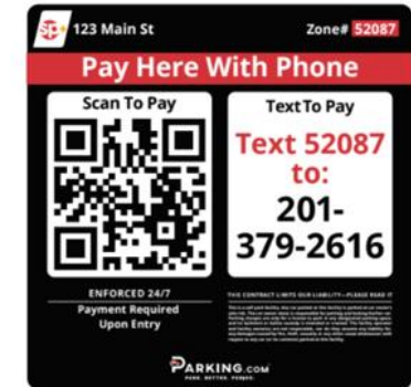
32" x 32" Pay Sign