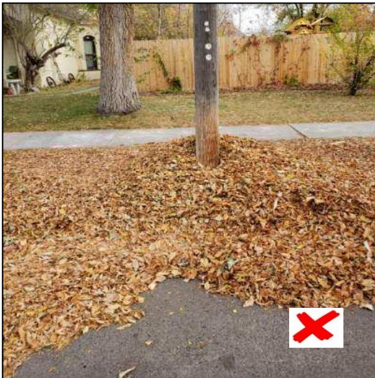
Not raked /around pole