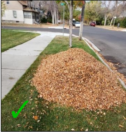
Raked/ piled on Boulevard