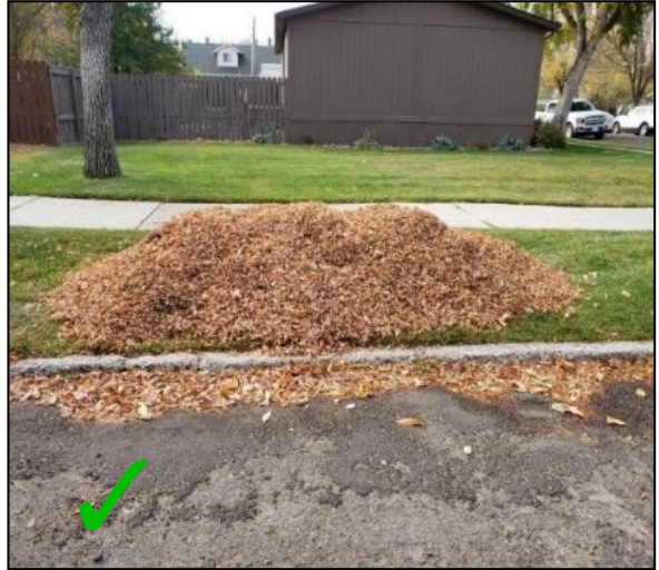
Raked/ piled on Boulevard – Cars Moved for Equipment