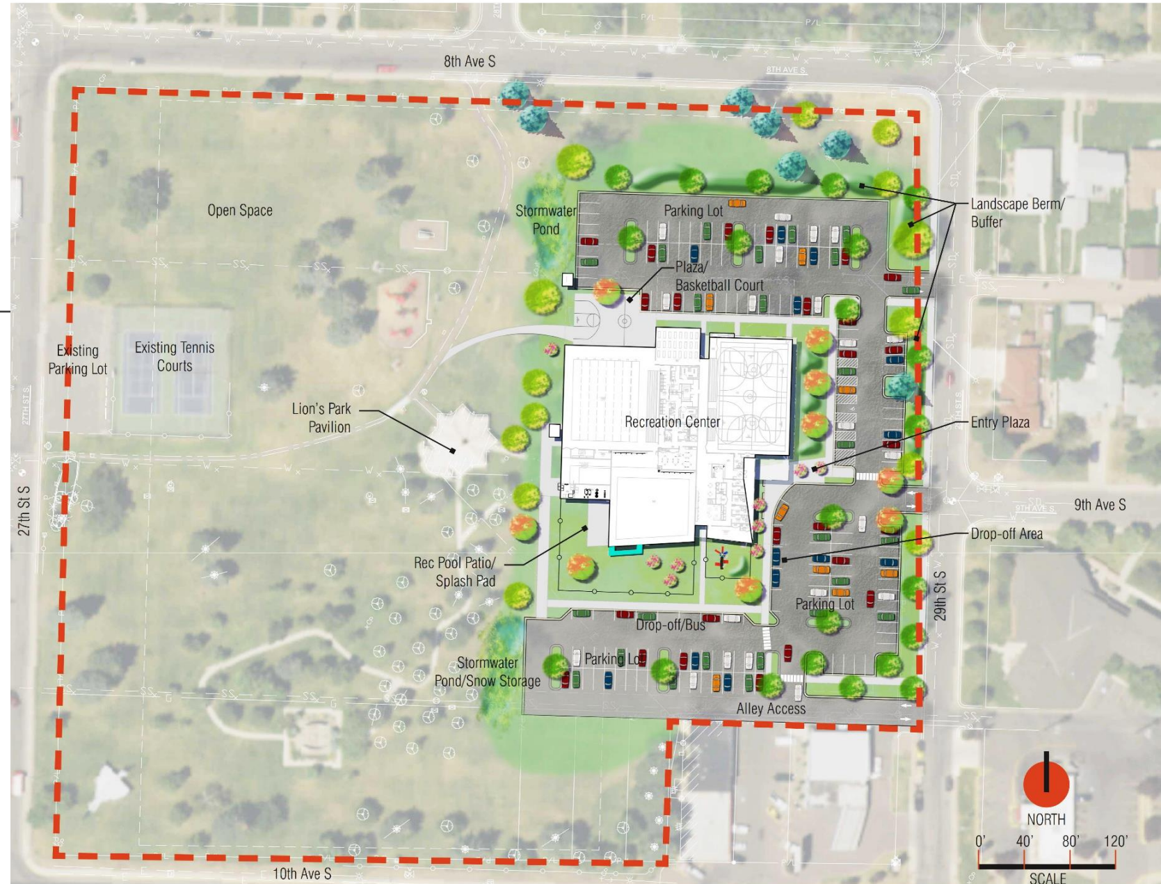
Great Falls Recreation Center: Conceptual Site Plan