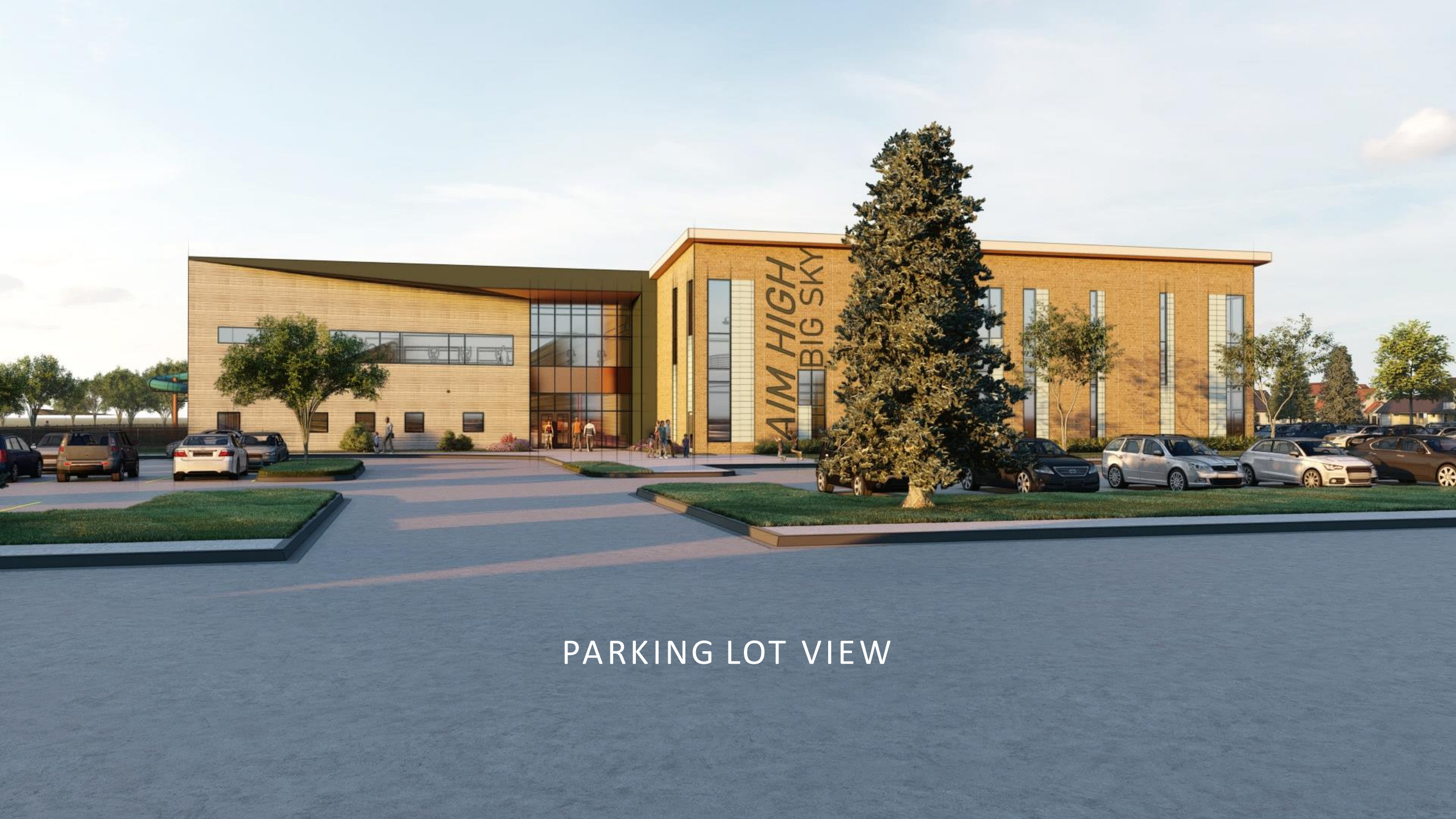
PARKING LOT VIEW