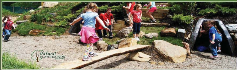
Natural Playground Area