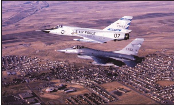
A Montana Air National Guard F-106 Delta Dart and F-16 Fighting Falcon fly over the Valley View and Riverview neighborhoods in 1986.

Neighborhood Council 3 is made up of five members representing residents living in the Riverview, Valley View, Skyline and Eagles Crossing neighborhoods of Great Falls, Montana. The five council members are elected by voters living within the district during regularly scheduled city general elections for two-year terms.