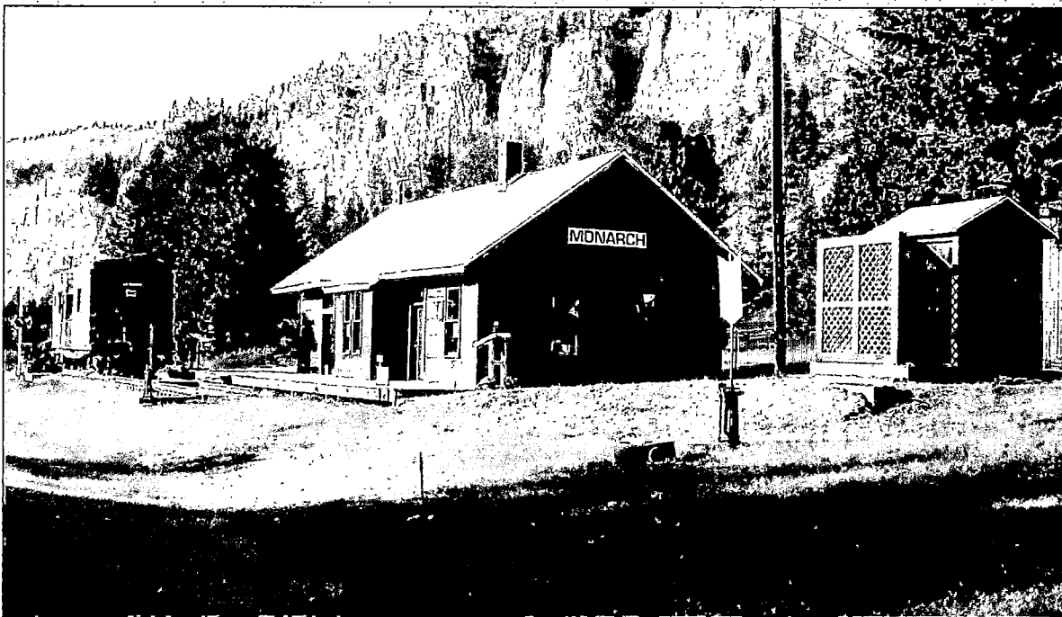
Figure 6: Overview of restored Monarch Depot complex