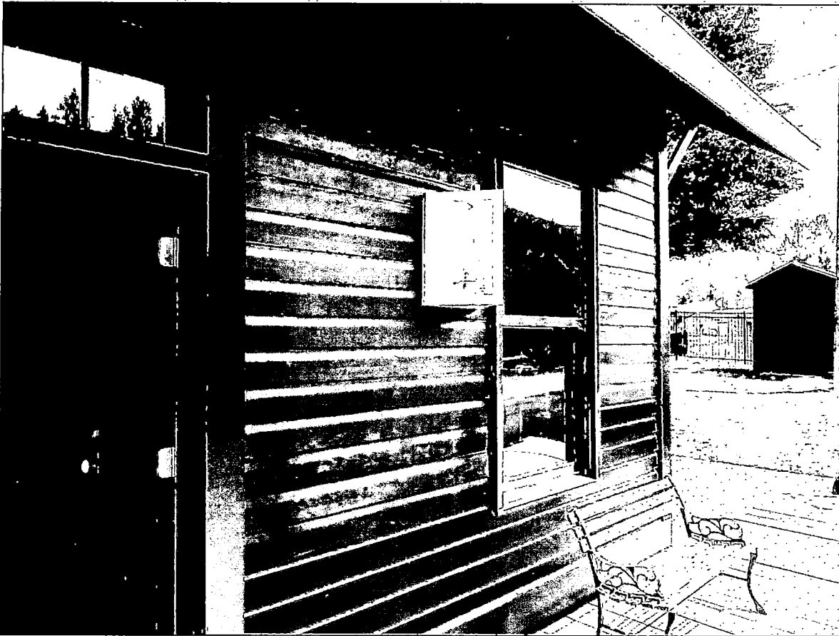
Figure 5: Freshly painted exterior with historically accurate lamps and six-over-six double hung windows