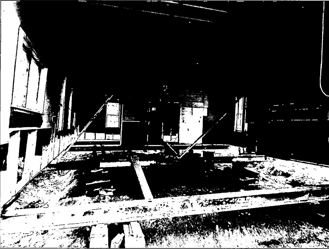
Figure 3: Interior restoration in progress