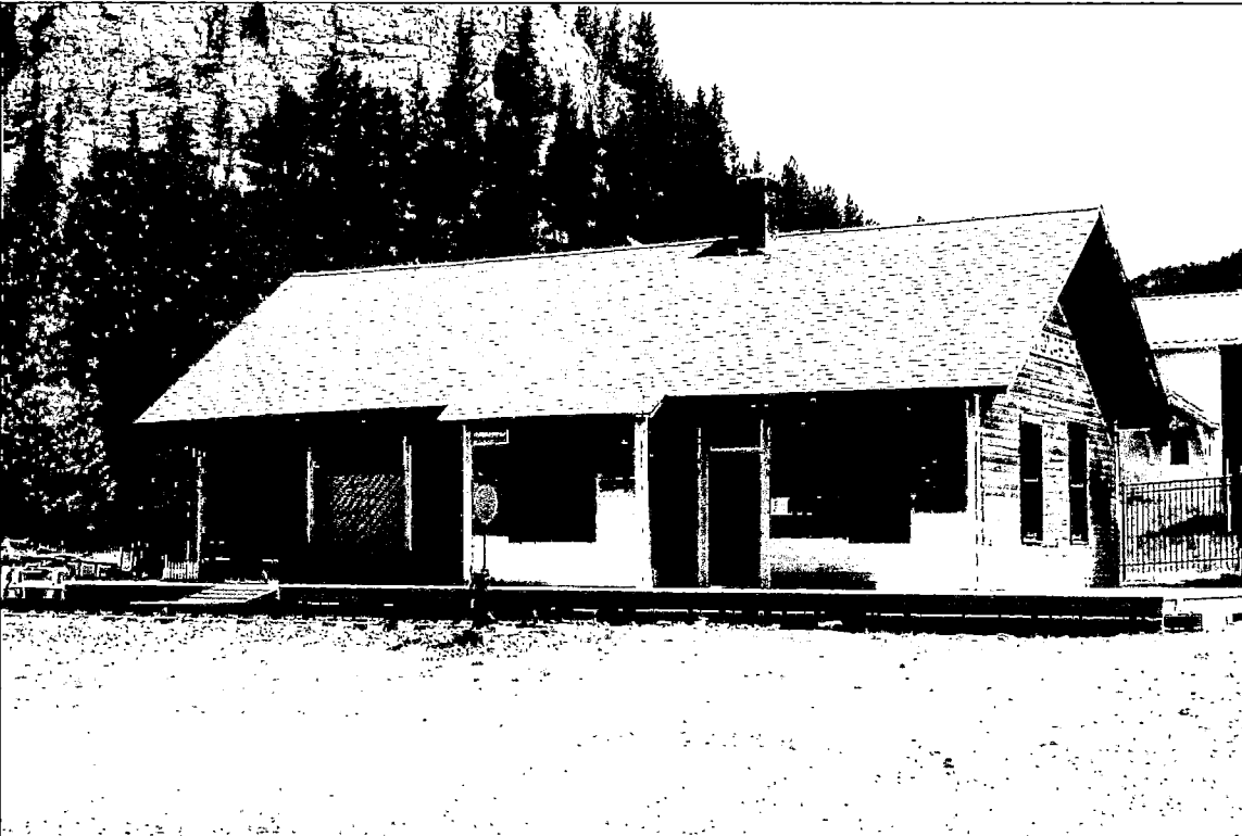
Figure 2: New roof, new platform, exposed exterior cladding