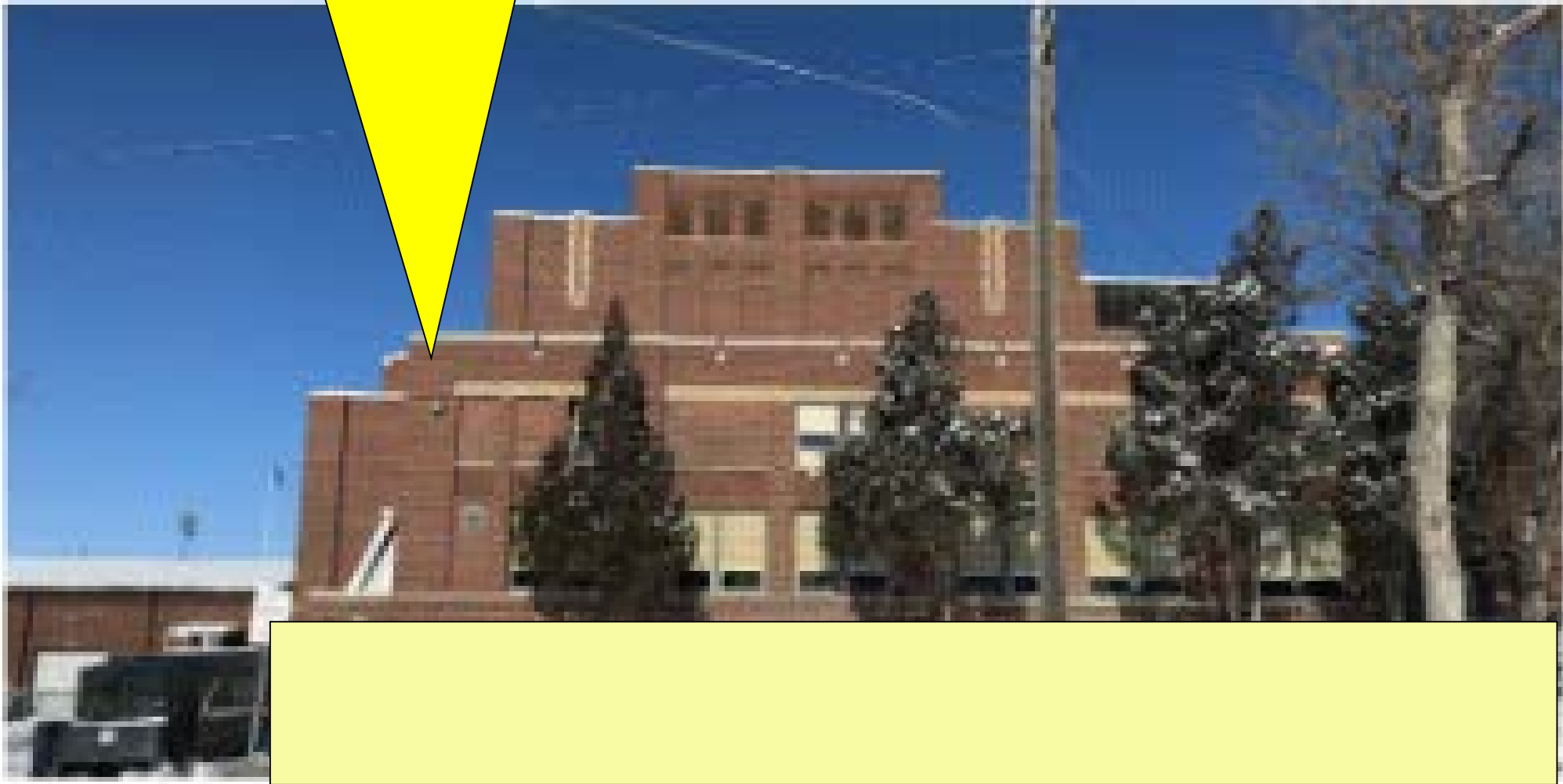
PHOTO OF THE SOUTH SIDE OF THE HISTORIC MAIN CAMPUS

KEEPING THE BUILDING VISIBLE ABOVE THE GROUND FLOOR IS A BETTER HISTORIC SOLUTION THAN CONCEALING IT.