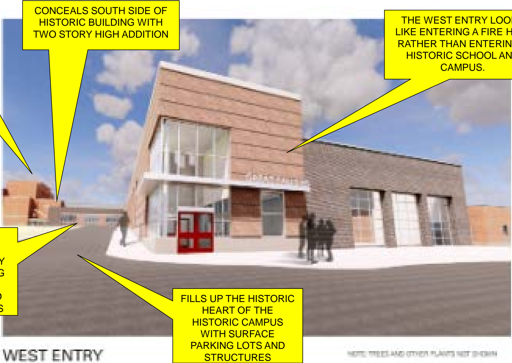
RENDERING OF WEST SIDE OF NEW ADDITION LOOKING FROM 4 TH AVENUE SOUTH BY NE45 AND BASSETTI ARCHITECTS

BY DARRELL SWANSON AIA 06/13/18 406.599.6910