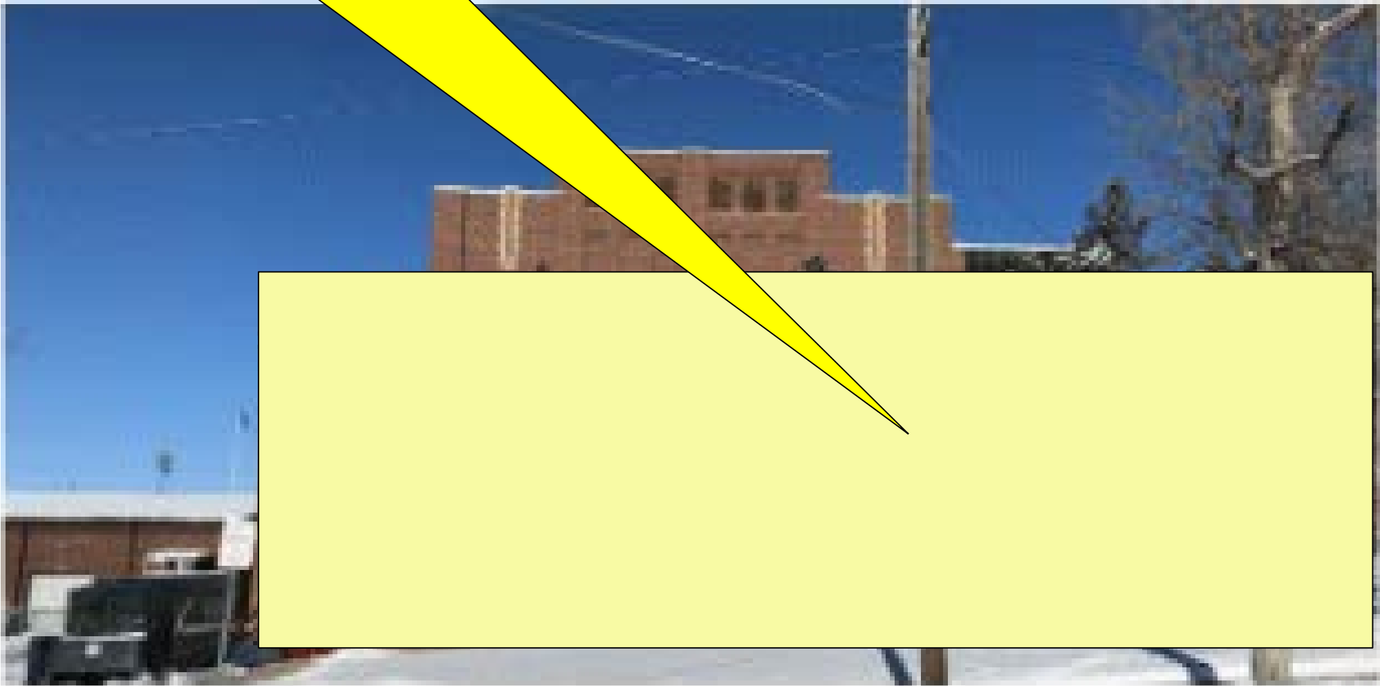
PHOTO OF THE SOUTH SIDE OF THE HISTORIC MAIN CAMPUS

CONCEALS SOUTH SIDE OF HISTORIC BUILDING WITH TWO STORY HIGH ADDITION RATHER THAN KEEPING THE BUILDING VISIBLE ABOVE THE GROUND FLOOR