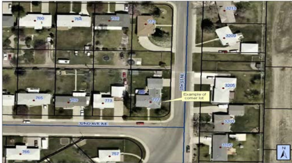
Example of corner lot