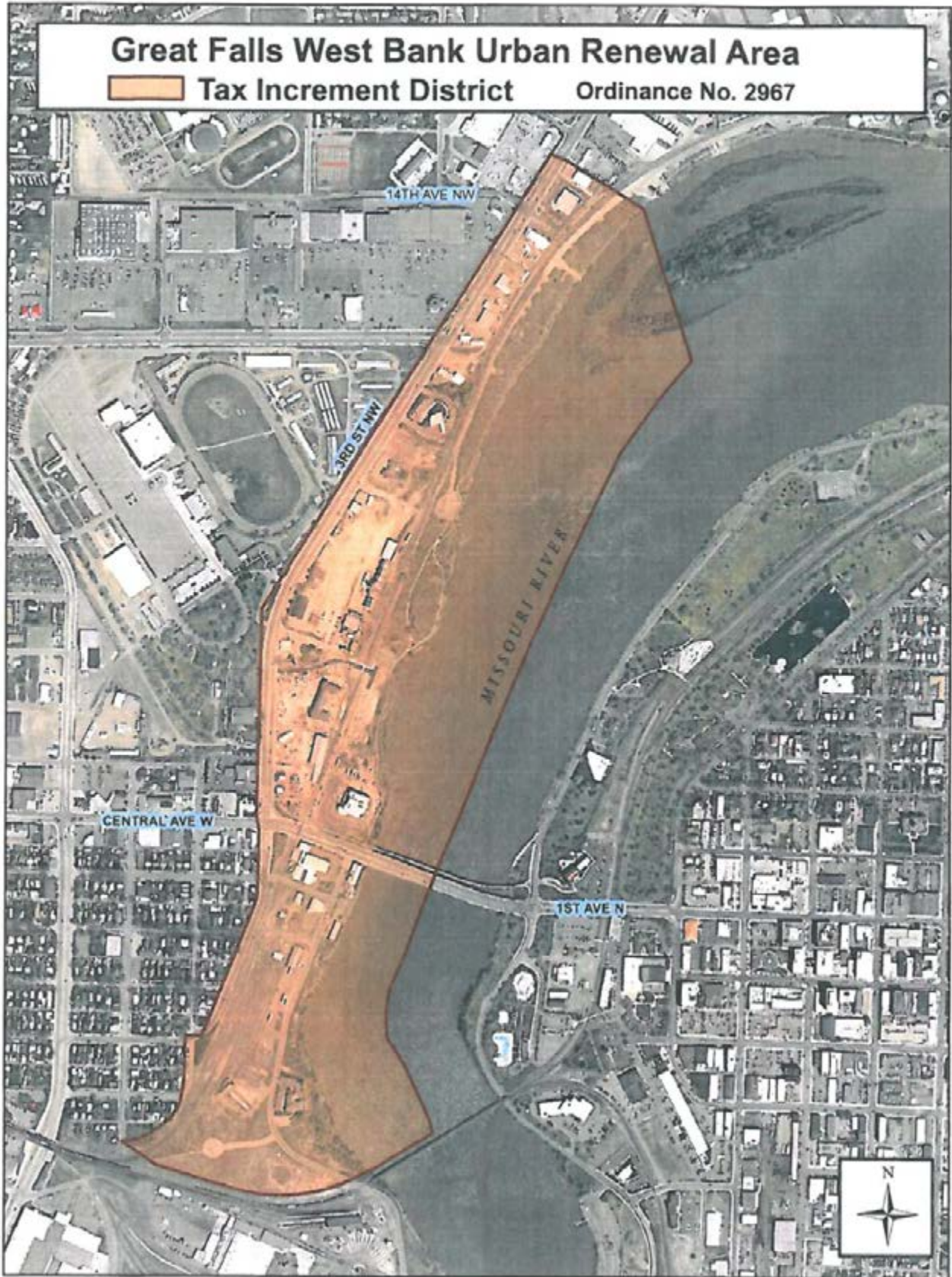
EXHIBIT A - RENEWAL AREA