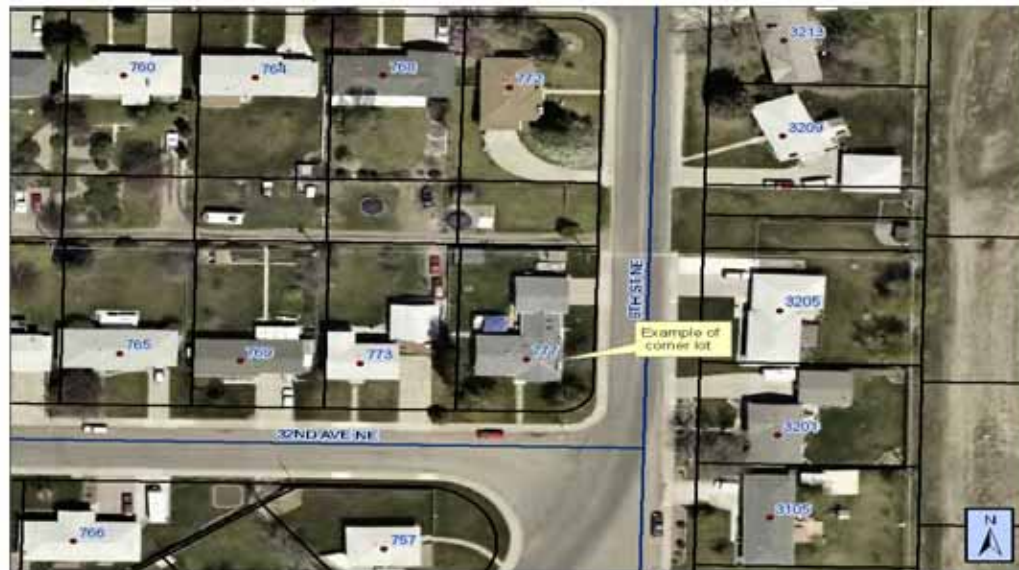
Example of corner lot