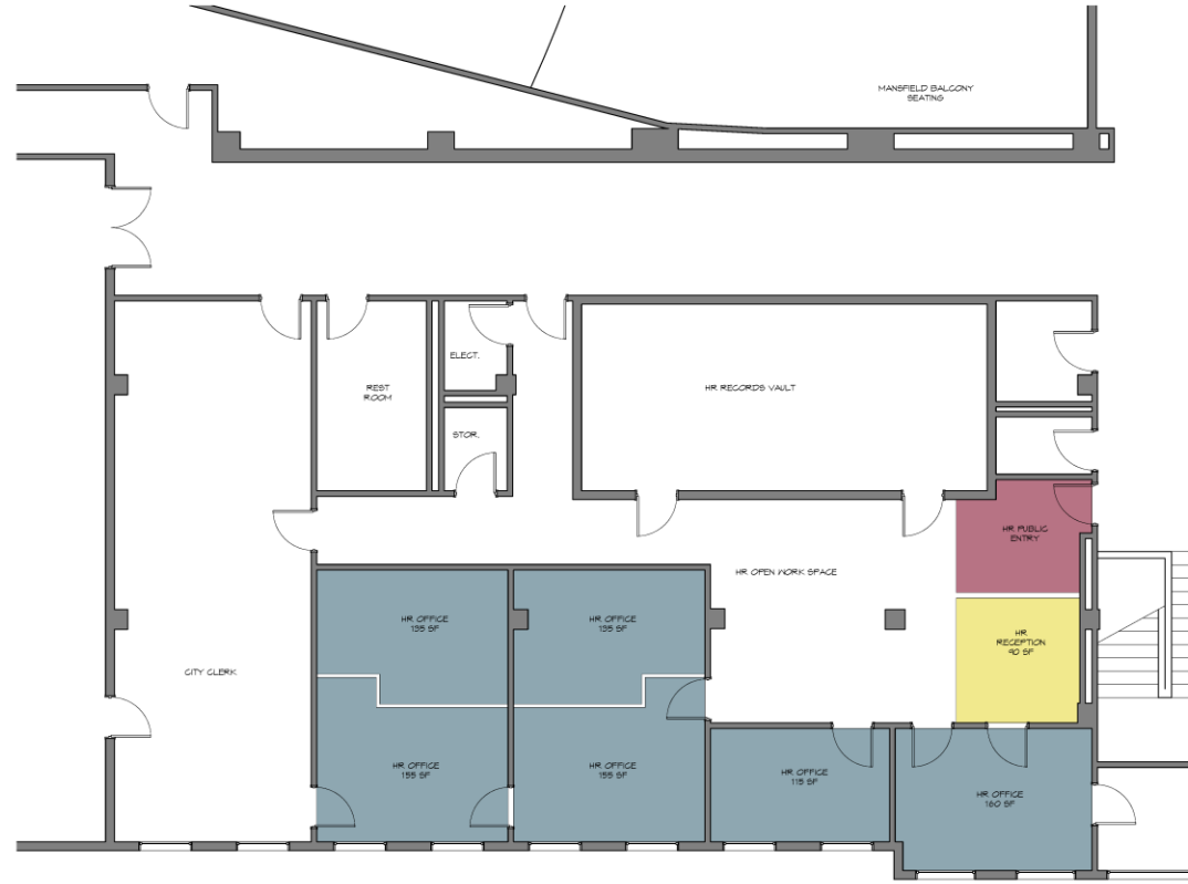
2 PROPOSED HR OFFICE REMODEL 1/4" = 1'-0"