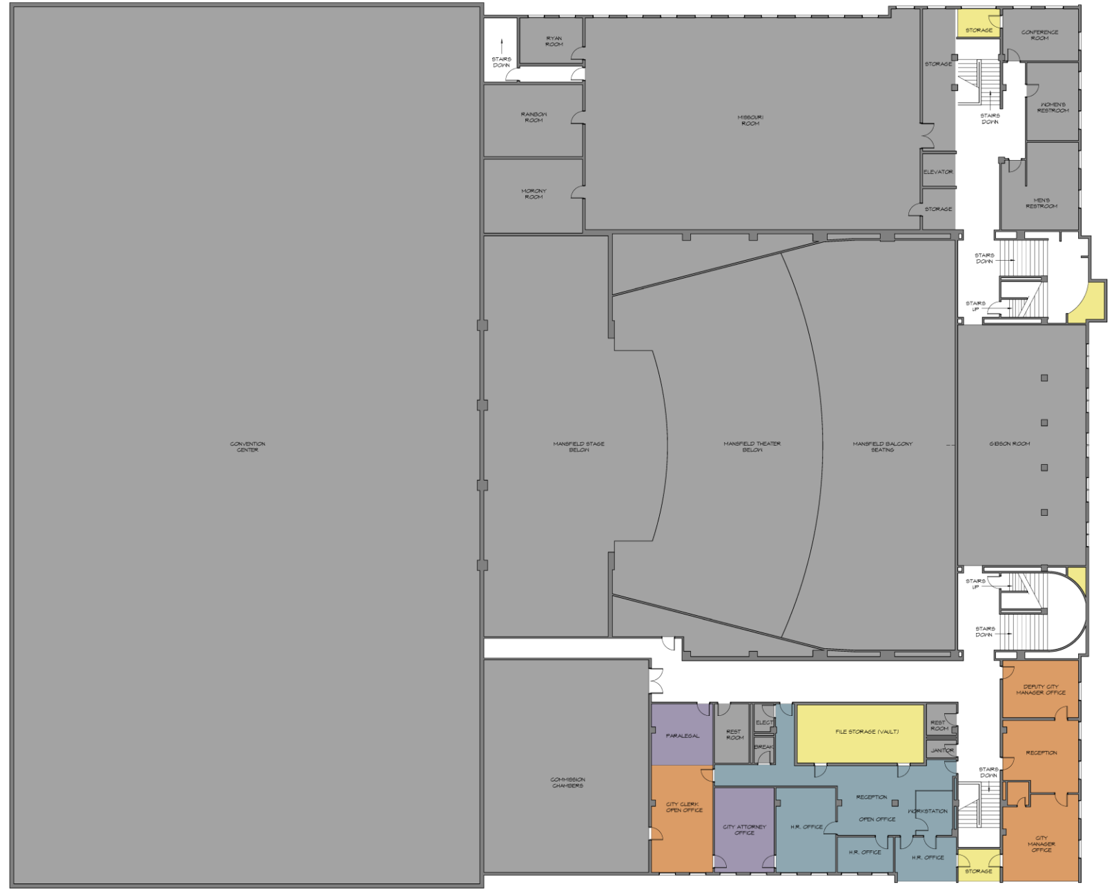
1 EXISTING 2ND LEVEL FLOOR PLAN 1/8" = 1'-0"