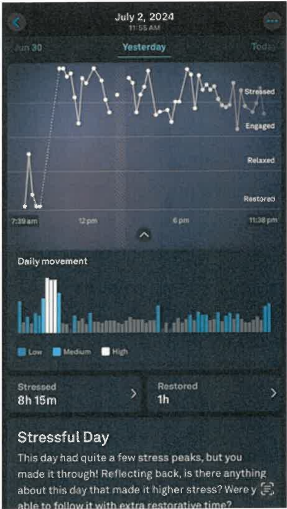
Attachment 2-Personal Picture and Oura Ring Data-Candice Griffith 2-5 July, 2024