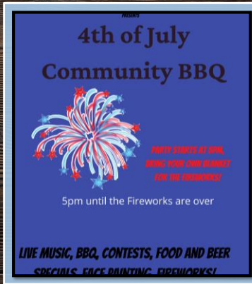
LIVE MUSIC, BBQ, CONTESTS, FOOD AND BEER SPECIALS, FACE PAINTING, FIREWORKS!