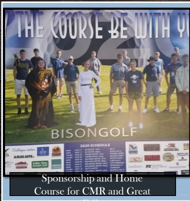
Sponsorship and Home Course for CMR and Great Falls