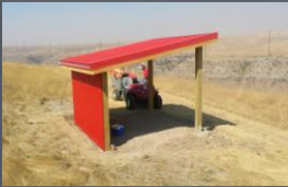
South Shore Shelter