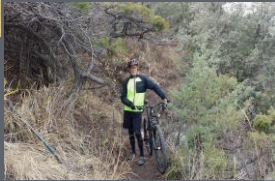
New South Shore Single Track